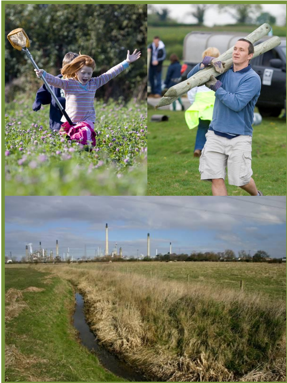
Top left: Young people inspired at events; Top right: Local people active through volunteering; Bottom: Goway Meadows, 165 ha of floodplain grazing marsh adjacent to Stanlow oil refinery.